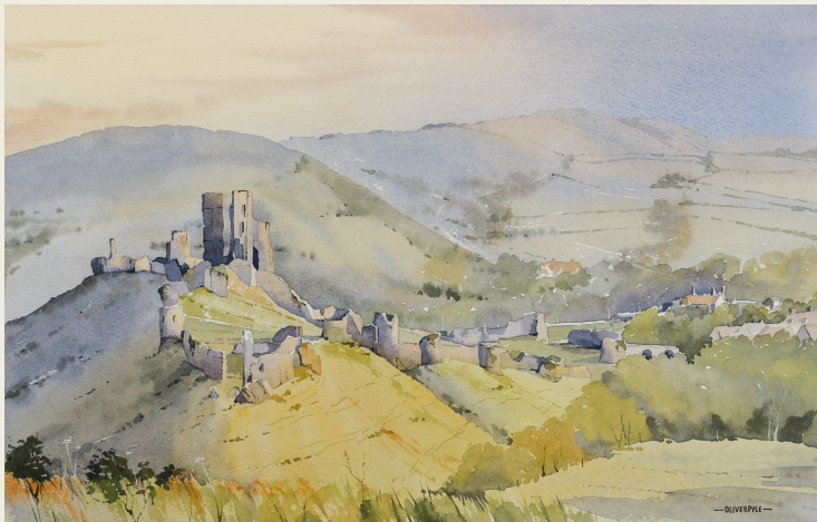
'A Beautiful Evening, Corfe Castle'

Having made a number of pencil sketches for my client to review we both felt that this composition captured all the aspects required of the brief.