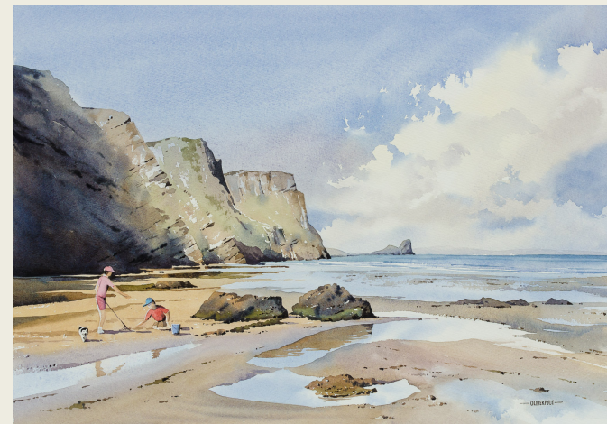
'Among The Rock Pools'

I made several quick figure sketches in pencil until we were happy with their position and activity on the beach, and then a small pen and wash painting to bring all the elements together. Some fine tuning was needed for several aspects of the composition and these were taken into account in the final painting.